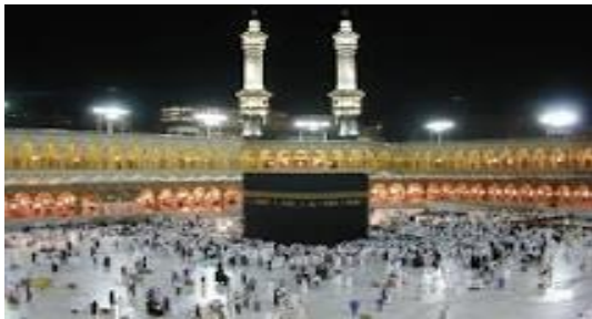
Kaaba in Mecca 1

The Allah of Islam is worshipped at the Kaaba. The Muslims must visit the Kaaba at least once in a lifetime. The Muslims claim that the Kaaba was the first House of Worship, and that it was built or re-built by Abraham and Ishmael on God's instructions.